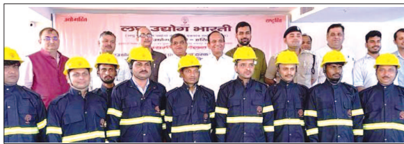
LUB's Fire and Rescue Task Force was formulated at Udyami Sammelan organized by Haridwar Unit of Uttarakhand State on 27th Sept. 2023.