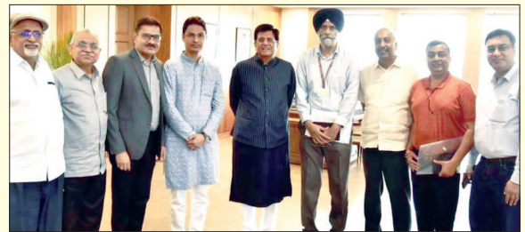
LUB's North Bengal Unit met with Union Commerce Minister Shri Piyush Goyal to solve Issues related to Auction, Subsidy and Darjeeling.