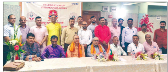
LUB's South West Bengal Unit Celebrated Vishwakarma Jayanti on 17th Sept. 2023.