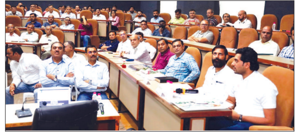
LUB's Valsad District Unit of Gujarat State conducted a Successful Event on Startup Policy and Government e-Marketplace Portal.