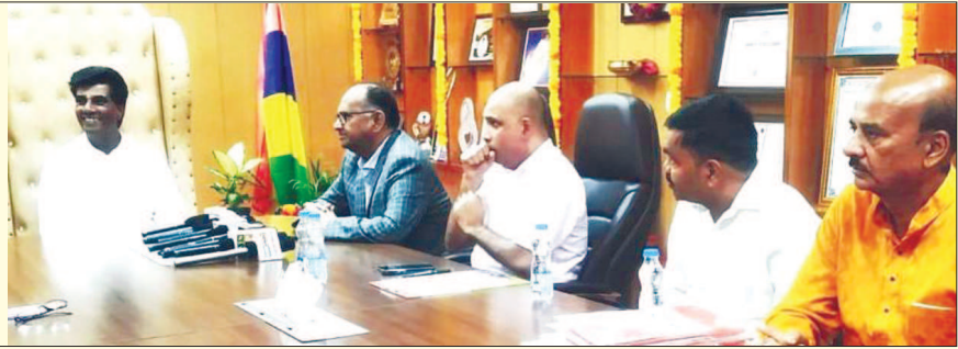
LUB's Varanasi Unit (UP) arranged a meeting of Entrepreneurs and Industry People with the Cabinet Minister of the Republic of Mauritius on 10th Sept. 2023.