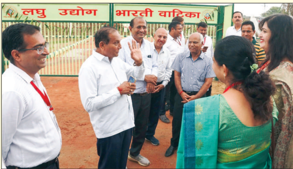
LUB's Beawer (Rajasthan) Main Unit & Women Wing jointly Developed Plantation and Greenery on allocated 2000 square meter land.