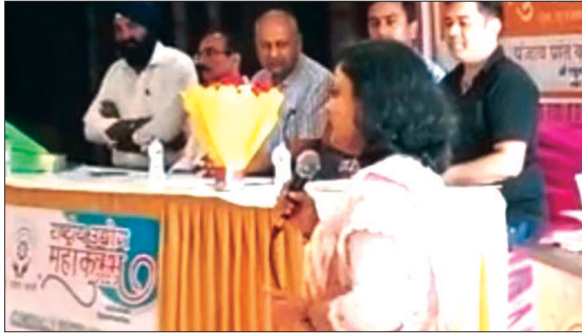
LUB's Derabassi Unit of Punjab State conducted a Meeting which was attended by 75 Members on 10th Sept. 2023.