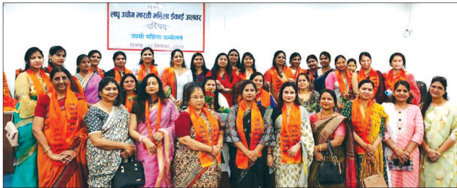
An Effort was made by the Coordinating Unit for constituting a Women Wing by conducting a Udyami Mahila Sammelan at Alwar on 15th Sept. 2023.