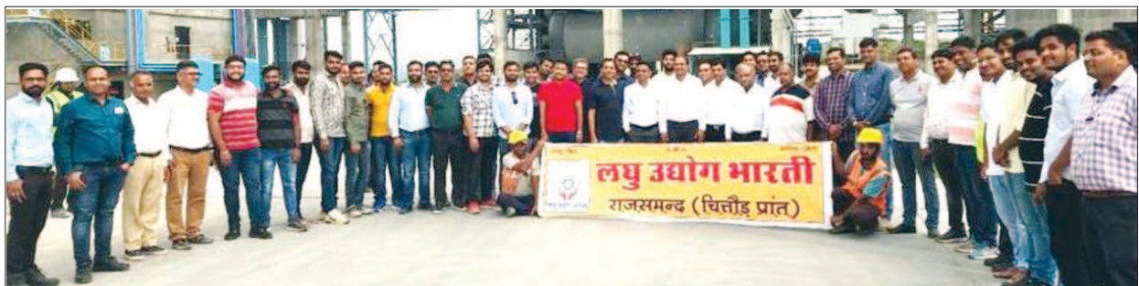
LUB's Rajsamand Unit (Rajasthan) Officials visited Wonder Wall Putti Plant run by RK Group for organizing Udyog Darshan Exhibition on 23rd Sept. 2023.